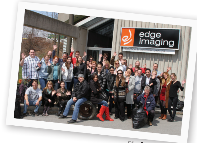
Edge Earth Day Cleanup

Now, we are in the process of converting all light sources, over 360 lights, in our Ontario-based head office and lab to sustainable energy efficient lights.